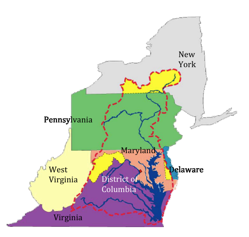
Figure 1.1: The Chesapeake Bay and its tributaries are located on the East Coast, spanning six states (MD, VA, WV, PA, NY, DE) and Washington DC and emptying into the Atlantic Ocean. Image used with permission [3].

levels corresponds to a decrease in water clarity and has a negative impact on dissolved oxygen levels as the algae decomposes. Turbidity is an important measurement of water clarity, the latter being necessary for light to reach submerged aquatic vegetation (SAV) and promote growth. Turbidity is measured in Nephelometric Turbidity Units (NTU) which measures the extent to which a focused light beam scatters in the medium. When analyzing the measurements of chlorophyll and turbidity, larger numbers correspond to less healthy water. Conversely, when considering dissolved oxygen concentrations, higher readings are preferable. While a reading of 5mg/L is widely considered a failure threshold, a threshold of 3mg/L is often used to test for waters that are severely oxygen-deficient [9].